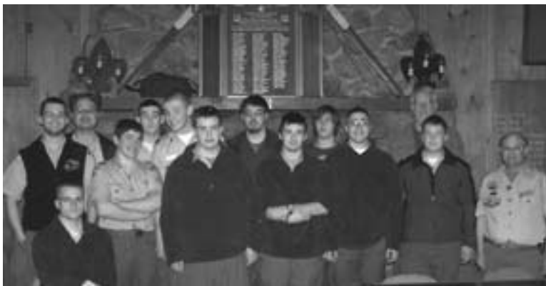
Staffed in Service: The 2007 Pine Tree Council Winter Camp Staff - 100% lodge members...stand in the Wheel Room at the Training Center during a break at the week's festivities.

The camp was full, with 32 youth participants filling out four patrols – named after the original patrols on Brownsea Island with Baden Powell – Bulls, Ravens, Wolves, and Curlews. Participants spent the week working on 3 to 4 merit badges, went snow tubing, built and spent one night in quinzee shelters, visited the Perry-MacMillian