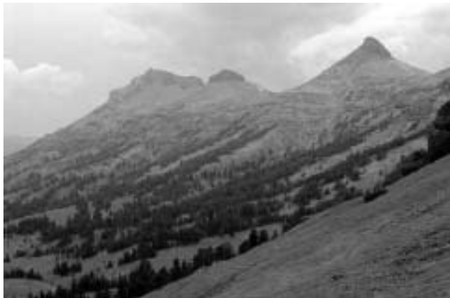
Grand Teton National Park: Just one of the great views you can partake if you attend ArrowCorps5 with the Lodge in 2008!