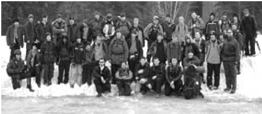
The Entire Gang! A great group shot of the 2007 Council Winter Camp in front of the COPE tower at Camp Hinds.