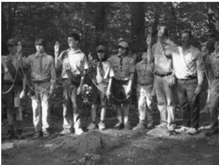
Bound in Brotherhood: Soon to be Ordeal members take the Obligation of the Order during one of the Ordeal ceremonies at the second Hinds Ordeal in June.

Despite a Late Start, Lodge Elections lead to a Solid Spring Ordeal Season