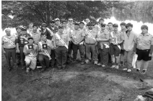
Turtle Contingent: The 42 brothers who attended the section conclave from Madockawanda Lodge pose for a group shot during Saturday's activities at TL Storer Scout Reservation.

With Motswetuset Lodge hosting the 2007 Section Conclave at TL Storer Scout Reservation in Barnstead and with an expected turnout of over 400 scouts and scouters alike, one had to wonder how our approximately 40 participants would do in the various fellowship activities and friendly competitions. Well, I'm glad to report that we achieved some impressive "heights" on the June weekend! The lodge again took home the Silver Tomahawk award as the lodge providing the most service to it's council. That represents the 11th year