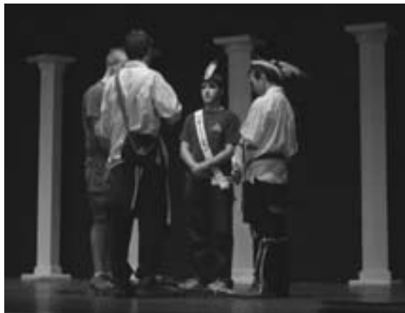
Ceremony Work: Members of the lodge stage the pre-ordeal ceremony during the ceremonial evaluation session at the LLD.