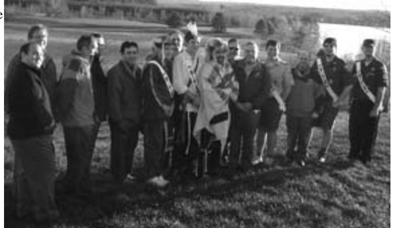
Leadership in Service: A group of Vigil Honor recipients from our lodge pose on the hill overlooking China Lake right after an early morning rededication at the 2006 LLD.