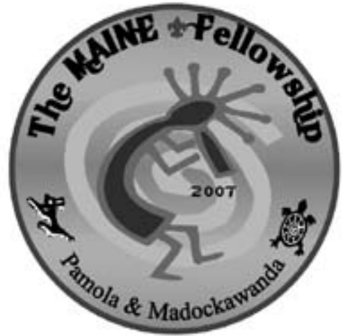
AIA Logo: Here is the artwork and patch for the 2007 AIA weekend!