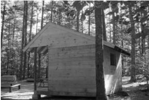
Chapter Service: A picture from last fall after Casco Bay completed the new lean-to at Patrick campsite. A few finishing touches are planned for the Spring of 2006!.