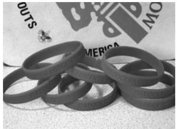
Wear the Band Proudly: Here is a group shot of the new purple lodge bracelets which are currently available at the Turtles Trading Post!