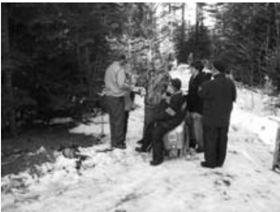
On the Trail! A brother from K-Valley Chapter works with a sled from a local troop during the 2006 Klondike Derby.