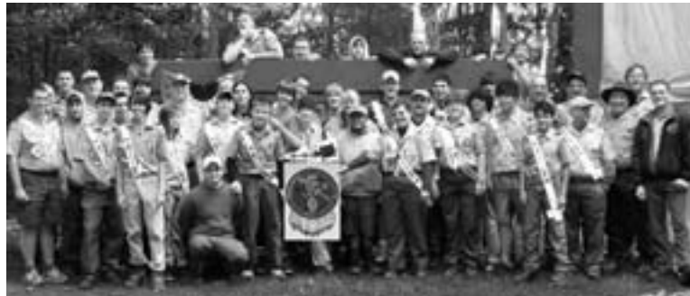
Our Lodge at the Conclave: Above are the members of Madockawanda Lodge who made up the contingent at our Section Conclave at Camp Wah-Tut-Ca, Yankee Clipper Council.