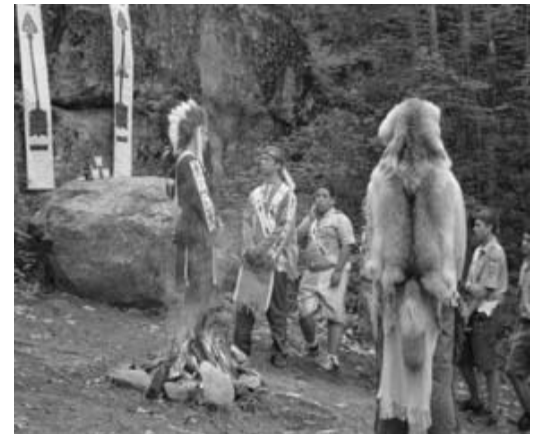
At the Ceremony Site: Ordeal candidates are led around the circle of our lodge during the Ordeal ceremony at the second Spring Ordeal weekend at Camp Hinds.