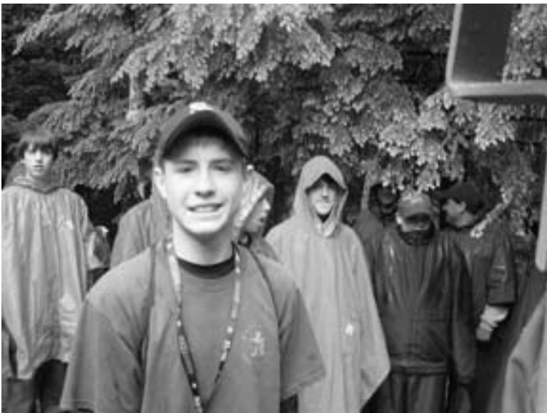
A Trott of Rain: Lodge members stand outside the dining hall at Camp Wah-Tut-Ca waiting for lunch to be served at the NE-IA Conclave.