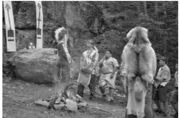
Ceremonies & Service: Brotherhood Candidates (Above) participate in the ceremonies at the second spring Ordeal at Camp Hinds, while brothers (right) work diligently on the completion of the new waterfront desk. Below...well.... it's from Conclave but were not sure what they're celebrating!