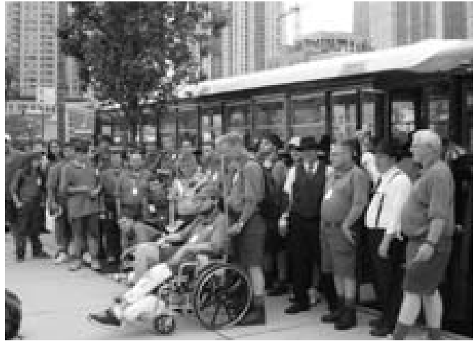
You Can't Touch This: The 2006 contingent (above) poses for a picture after completing the Untouchables Tour in Chicago, one of the great adventures on our NOAC trip!