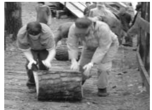
Two Dedicated to the Task: Two candidates from the first Spring Ordeal at Hinds help to roll parts of a tree stump removed from the boating area - part of our lodge's work to prepare for summer camp.

With two decidedly different weekends from a weather standpoint, the lodge added over 100 new members. The Spring Ordeals succeeded in helping Camp Hinds get ready for summer camp, including the addition of a new walkway for the waterfront. No doubt some of you experienced that great new addition this past summer! Otherwise, they were both fairly typical Ordeal weekends, complete with brush cleanup, burning, tree cutting, dining hall cleanup, and the installation of the exterior roof at the dining hall! Work also continued on the Bloomquist Meditation to get it ready for the summer camp season. It's also great to report that we had two very good brotherhood conversion ceremonies at both Spring Ordeals, which puts us in excellent shape to reach this Honor Lodge requirement for 2006. As of the first two spring