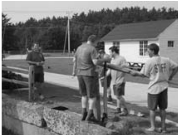
Founder's Day: Members of the Lodge help install a new post & rail fence around the back entrance to the Rotary Training Center during the Founder's Day project at Hinds!

Another great summer at camp, and a great show of service by the lodge during the weekly OA Service Hour and at the very warm Founder's Day work at Camp Hinds. We even were able to paint a few turtles on the benches/tables/fences we've built as a promotion to the lodge and the work we've accomplished at camp over the years! Projects included building and staining picnic tables, putting in a new fence in Tenny, installing a new roof at the BB range, fencing at the Archery/BB area, erosion control projects and digging a sump pit at Brownsea. It's also a chance to share brotherhood, help the Ranger and be with your fellow lodge members and attend camp (for those unable to spend a week with their troops) on a great summer night. To top it off, you got another one in the series of Service Hour flaps!