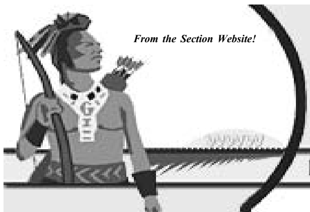
From the Section Website!