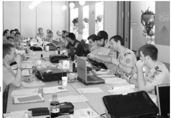
Not the QLS! Members of the lodge gather in Biddeford during March for the Lodge Executive Committee Meeting.