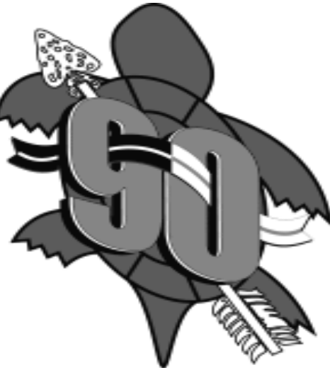
The Mothership: Unami Lodge "1" will celebrate the 90th Anniversary of the Order during festivities this Summer. Above is the theme logo for this event!