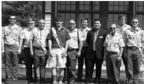
New Council Office: Members of the lodge who participated in the dedication and official opening of the new council office pose near the main entrance.

Representative Mike Michaud's office at the ceremony, as well as various members of the lodge who currently serve in a variety of roles in the lodge and council. Special events throughout 2005 will celebrate the opening of the new Council Service Center, including a time capsule, representing Pine Tree Council units and Scouting in Maine will be buried at the new site at the end of 2005 to be opened in 25 years! Make sure you bring your contribution to the time capsule to Pine Tree Council! 🍌