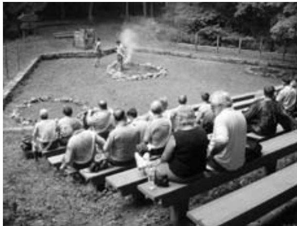
Reenactment of the First Ceremony: Brothers from Unami Lodge prepare the council ring on Treasure Island for a recreation of the first ceremony held on Treasure Island in 1914. Members from O-Shot-Ca Lodge of Miami, Florida, the # 1 rated ceremony team at the 2004 NOAC performed the flawless ceremony on two occasions during the 90th weekend!