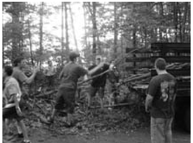
Cleaning up Camp! A group of cheerful brothers help load old stairs and brush from the "condo" area at Camp Hinds during the Week 4 Service Hour.

I am pleased to report that Madockawanda Lodge's OA Service Hour is alive and well at Camp this summer. Through the first five weeks, we have had 142 brothers participate in the program, and projects have been wide spread throughout camp. In addition to completing some of the prep work for the 90th Anniversary project, and some of the final touches to that project, including the touch up work on the benches, some of the service projects this summer have included cleaning and repair to the west beach walk leading from the main camp to the beach area, old wire removal near the pump house on Chipmonk Point on the Tenny side of camp, as well as the demolition and removal of the wood from the old water pump house itself. We've also had some of the brothers move some of the troop plaques in the dining hall, allowing us more "lower" rafter room for new troop plaques this year. Of course, there has been the traditional work cutting and moving brush throughout camp, and the clearing and re-marking of the colored trails that lead throughout camp.