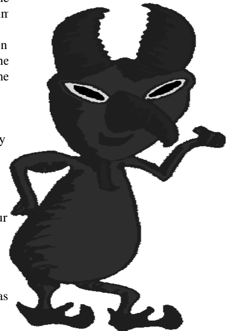
The Golden Eyed Kattywumpus

I wish to ask each of you to focus on the following with the coming of the fall. Make all the OA events you can, but stay loyal to your troop. Prepare for the Trailblazers Cub day in September – the council and the lodge will need your help and support. Take the time to contact the troops in your district during the fall, in order to prepare for you to visit them in the winter during election time. Spend time with your family and friends. Have fun. I would like to close with the following two points. First, William Shedd is quoted with stating that "a ship in harbor is safe, but that is not what ships are built for." The fall is the end of our 2005 season, but is also the time for us to plan for the 2006 season. We, as a lodge, have tried many new things – and I challenge each of us to continue to "sail our ships out of harbor and into untested waters," by trying and suggesting new ideas. It is only through change that we grow and become better at what we are charged to do – serve cheerfully.