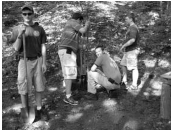
No Meditation Here: A bit of posing, and a bit of work in preparing the renovated meditation area at Camp Hinds. Check it out next time you're in camp!

Not to be outdone by the brothers who trekked to Philadelphia and Treasure Island, those of us "left behind" also honored the 90th Anniversary of the Order with a small token of service to our