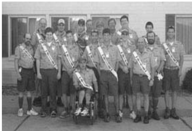
Madockawanda Contingent The members pose for a group photo on the opening day of the 2004 NOAC as they leave their hotel in Des Moines, Iowa on their way to Iowa State University.

This summer was the first time since the 2000 NOAC in Tennessee that Madockawanda Lodge took a full Contingent of 18 brothers, plus two brothers who served on staff, to NOAC. We started out from the Portland Jetport at 7am to make one of the flights we would have to take to get to Iowa and without having any problems and a few patch's already been traded we made it to Des Moines Iowa by 2 PM! With having most of the afternoon still free we found our hotel and checked in, and after check in some of us went swimming till dinner and the rest went out to see the town. For most of us, that involved shopping cart racing in a local parking lot! We then had dinner and again some of us went to back to the hotel and the rest went back to racing in the parking lot. Sunday was