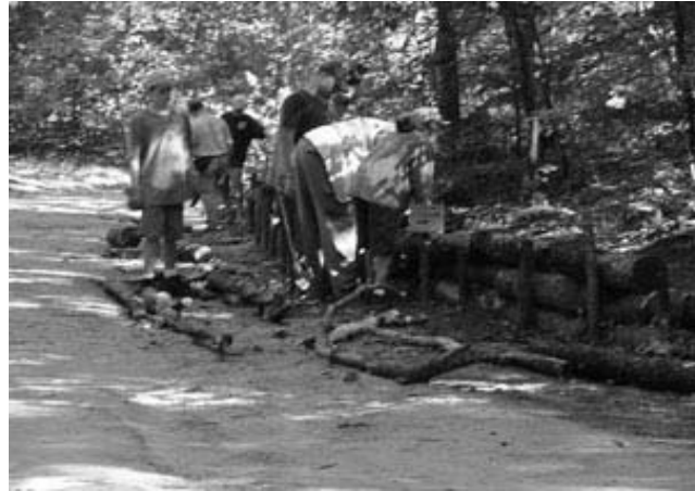
Ecology Project! A clan of candidates from the Fall Ordeal at Camp Hinds restore the erosion wall on the road leading into camp!