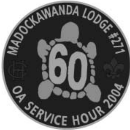
This Year's BIG Flap! The lodge recently released the graphic being used to make the 2004 Service Hour Flap!

UNBELIEVABLE! Can you believe that it's already the 6th year of the OA Service Hour at summer camp? Tens of Thousands of hours of service completed "cheerfully" by hundreds of our members of the Order, both from our lodge, and from lodges throughout the Northeast through "out of council" troops visiting both Camp Bomazeen and Camp Hinds. Aghast, Camp Bomazeen is now transitioning to Cub Scouting, so the Service Hour program at this site will have to take a "wait and see break" for a couple of years. Therefore, it's all up to our members and summer campers to maintain this service hour tradition at Camp Hinds. That means we have to be at camp on Thursdays for this hour of power! Tim Curtis has again agreed to be the Service Hour Chairman at Hinds, so we look towards another great year of evening projects for campers and visitors alike! The first service hour will be on Thursday, July 8, 2004, so I look forward to seeing you at one of these great evenings of service and fellowship!