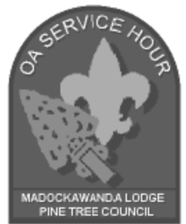
The 1999 OA Service Hour Patch, the first year of the program.