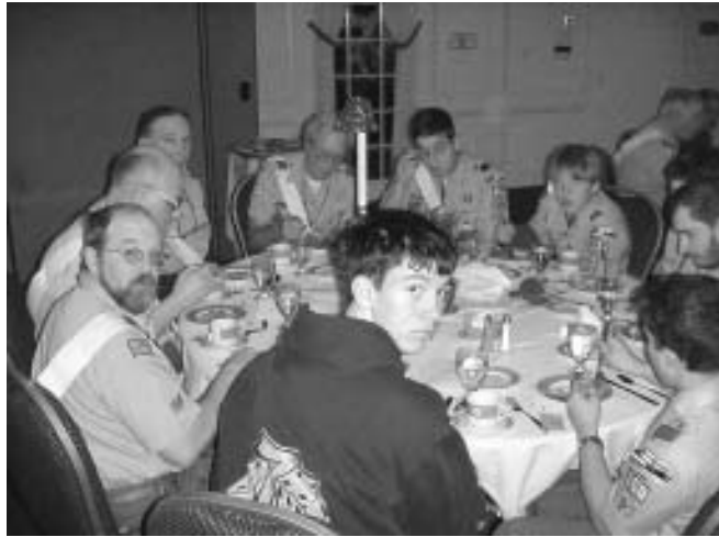
Wacky Abnakis! Members of Abnaki Chapter chow down at the 2003 Lodge Banquet.