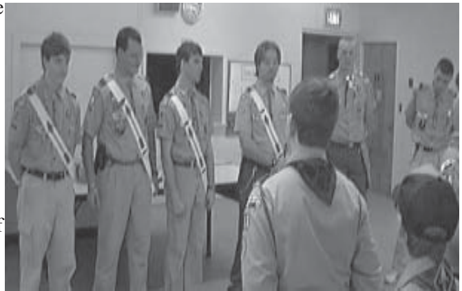
Line 'em Up: Members of a Downeast District election Team complete a unit election and troop visitation at Troop 207 in Rockland!

While the lodge is most visible in the Spring, Summer, and Fall months where we can be seen at both Camp Bomazeen and Camp Hinds (and at Nutter and Gustin) providing the ceremonies, service, and presence we are known for, we also play an important role during the winter months of the new year. Our role during this time is to visit as many of the 120+ units in our Council for unit elections and camp promotion.