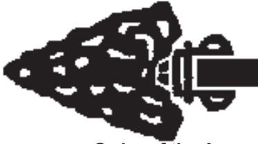
Order of the Arrow