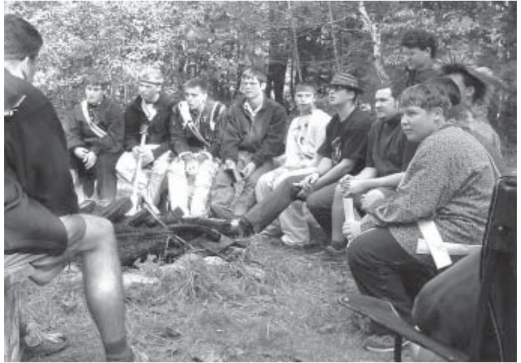
Ceremonial Gathering...Members of the various chapter ceremony teams meet after the LEC competition to discuss their work.