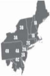
The Northeast Region